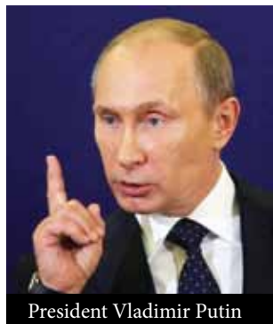
President Vladimir Putin

"I would like to point out that at the end of last year we were warned and you know this well that there would be a deep crisis," Putin said.