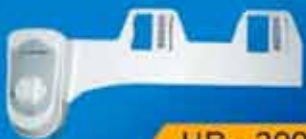
HB - 2000

خصم خاص للجالية العربية الكريمة... نضاهي اي سعر معلنه ب ٢٠% خصم