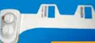
HB - 2500