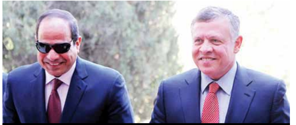
Egyptian President Mohammed Morsi with His Majesty King Abdullah II of Jordan

He said a protocol to prevent double taxation was signed between the two countries, meaning that Egyptian workers taxed in Jordan will be exempt from taxes in Egypt and vice versa.