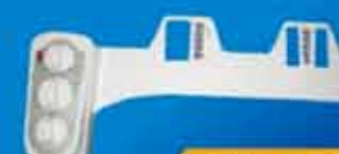
HB - 3000

Unlike other brands our products meet CSA Standard & are ISO 14001 certified. These are made in Korea, have back flow prevention system to prevent contamination of drinking water, have Polyurethane tube suitable for warm water.